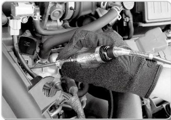
Quickly Check Circuits